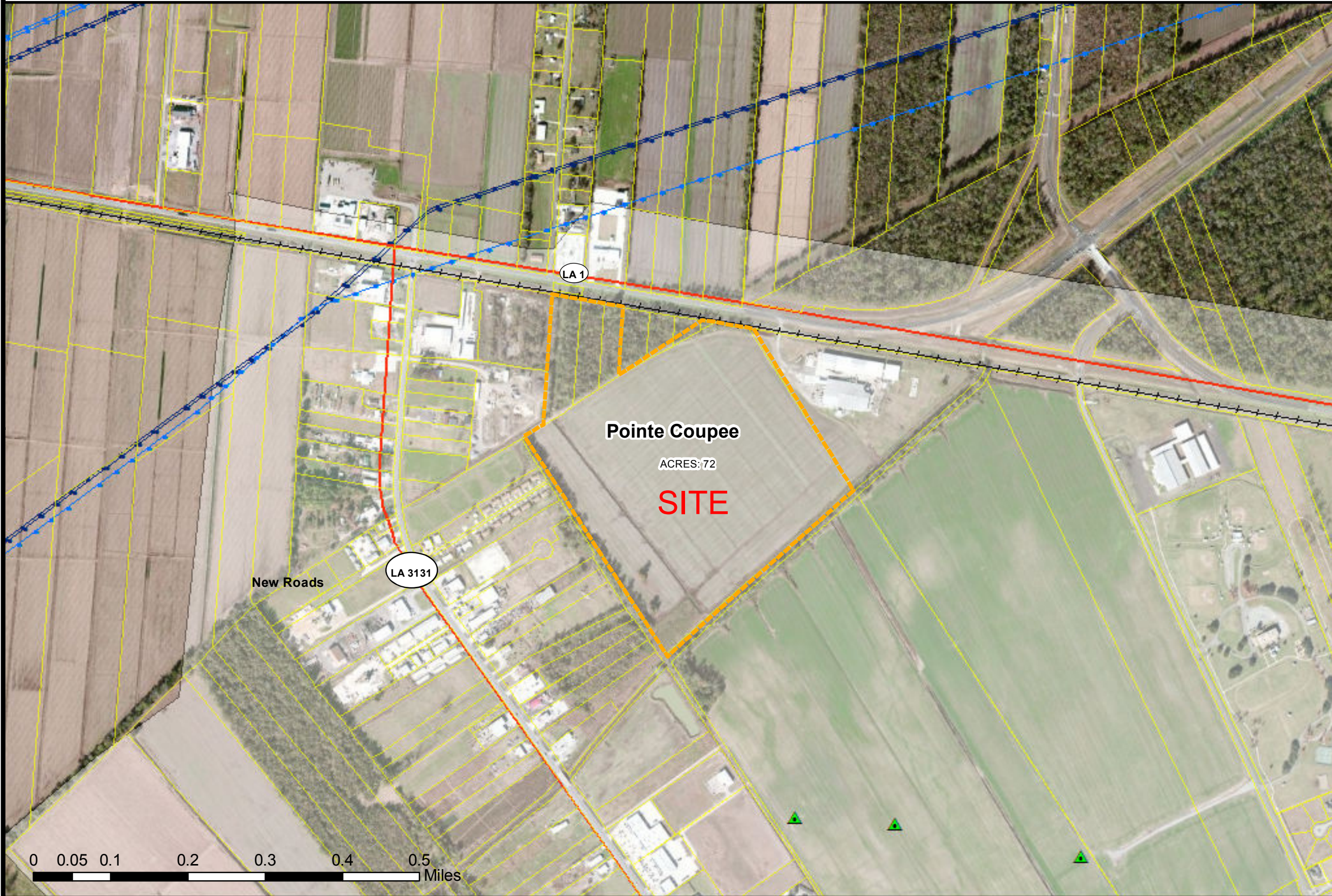
Exhibit X. New Roads Industrial Park Color Aerial Photo Map