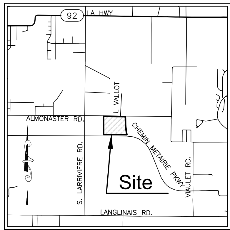
VICINITY MAP Scale: 1"=3000'±