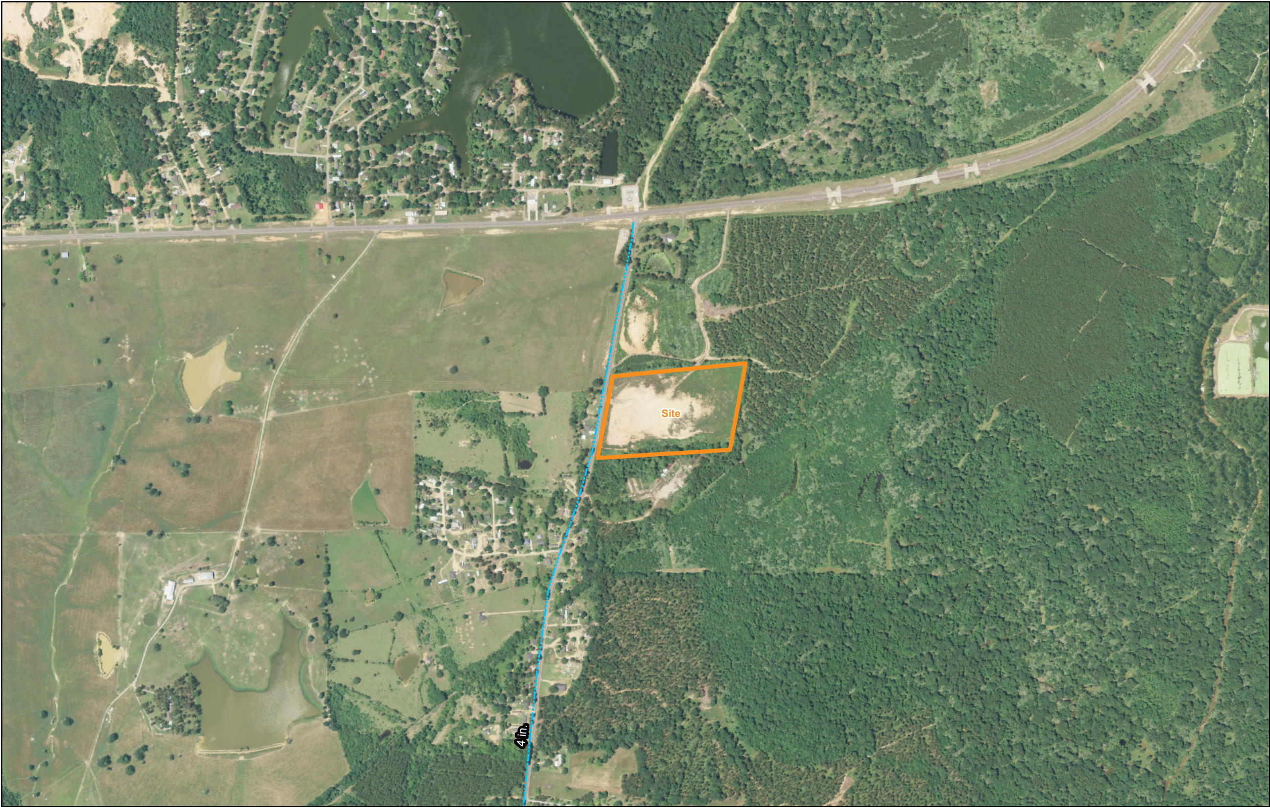
Exhibit F. Record Industrial Park Potable Water Infrastructure Map