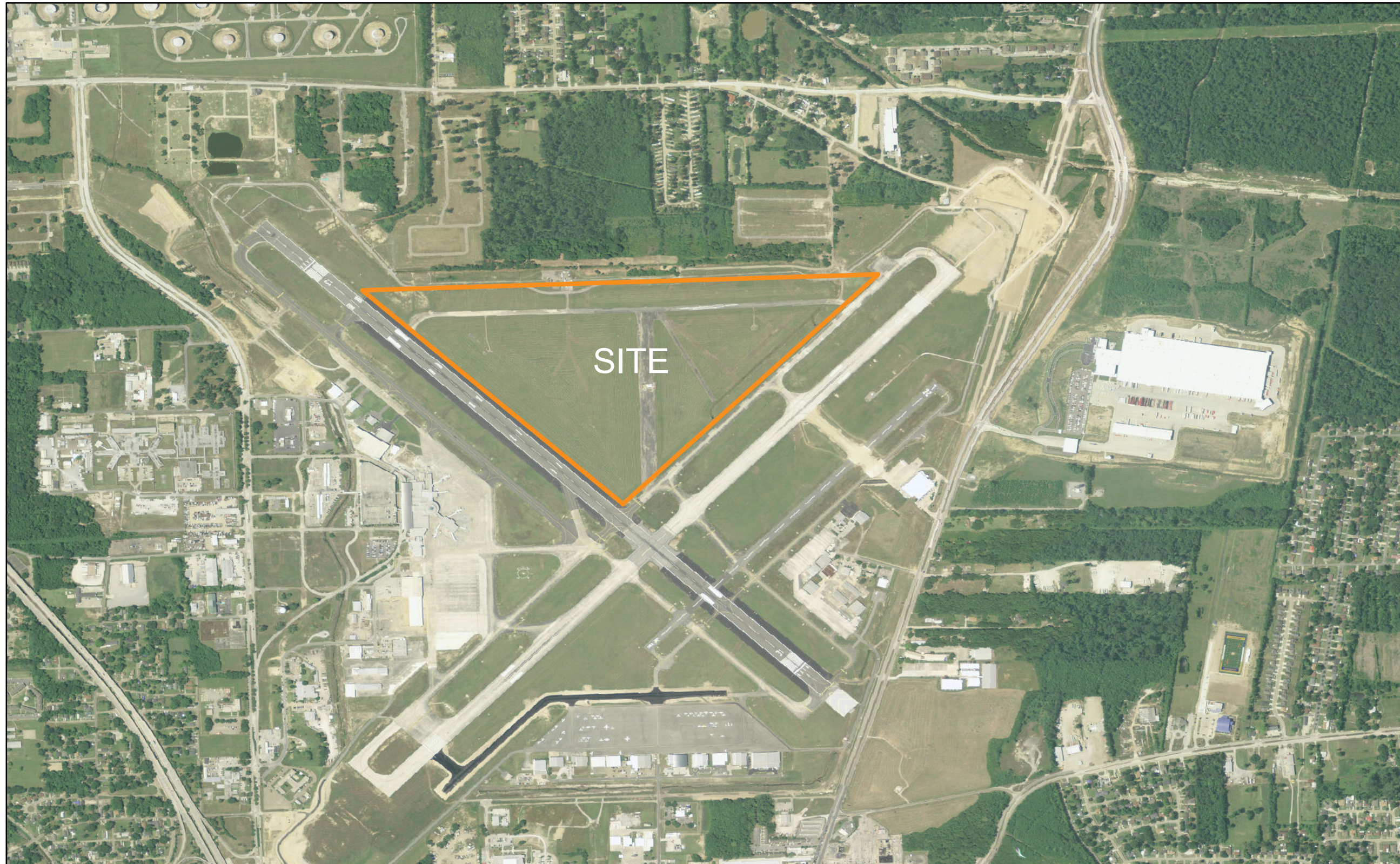
Exhibit S. Baton Rouge Aviation Business Park Color Aerial Site Photo Map