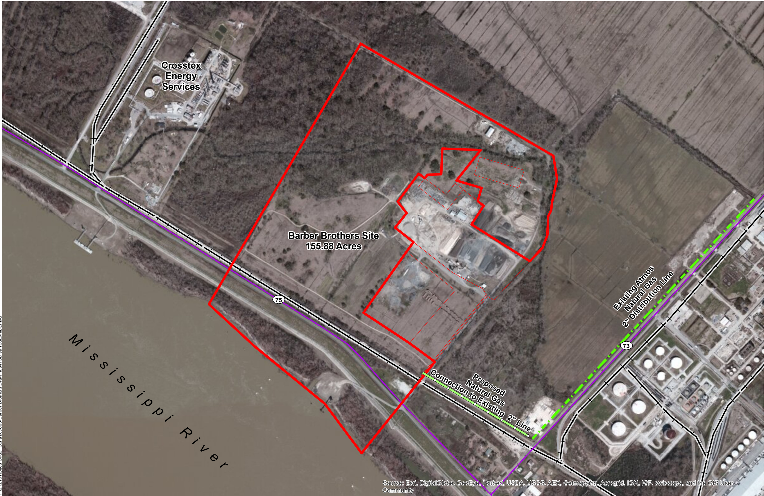
Exhibit Q. Waterloo Site Natural Gas Distribution Infrastructure Map

P:\212161\Sites Under Contract\005-Barber Brothers\Drawings\NGD\Prod\Exhibit.mxd