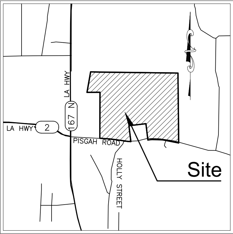
VICINITY MAP Scale: 1"=2000'±