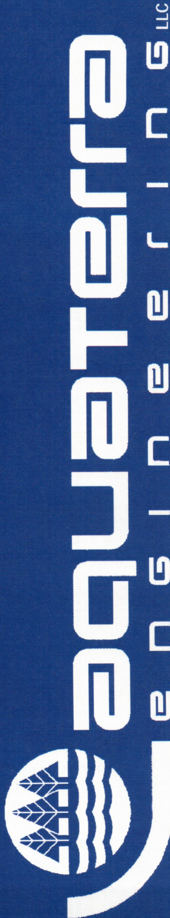
Exhibit 21 Phase I Environmental Executive Summary

PHASE I ENVIRONMENTAL SITE ASSESSMENT POINT HOUMAS HIGHWAY 18 DONALDSONVILLE, LA