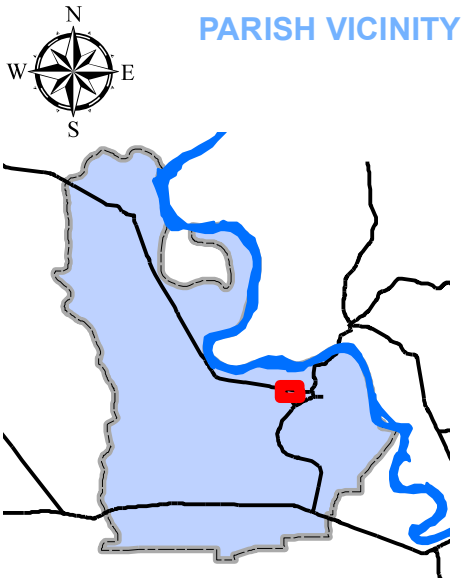
Exhibit V. New Roads Industrial Park FEMA 100 year Flood Plain Map