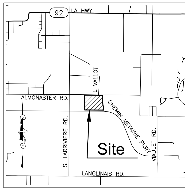
VICINITY MAP Scale: 1"=3000'±