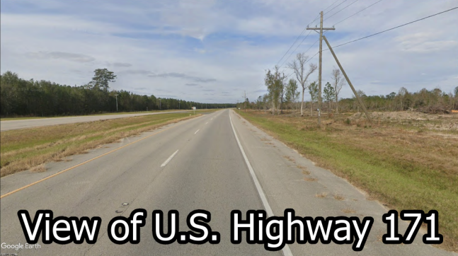
View of U.S. Highway 171