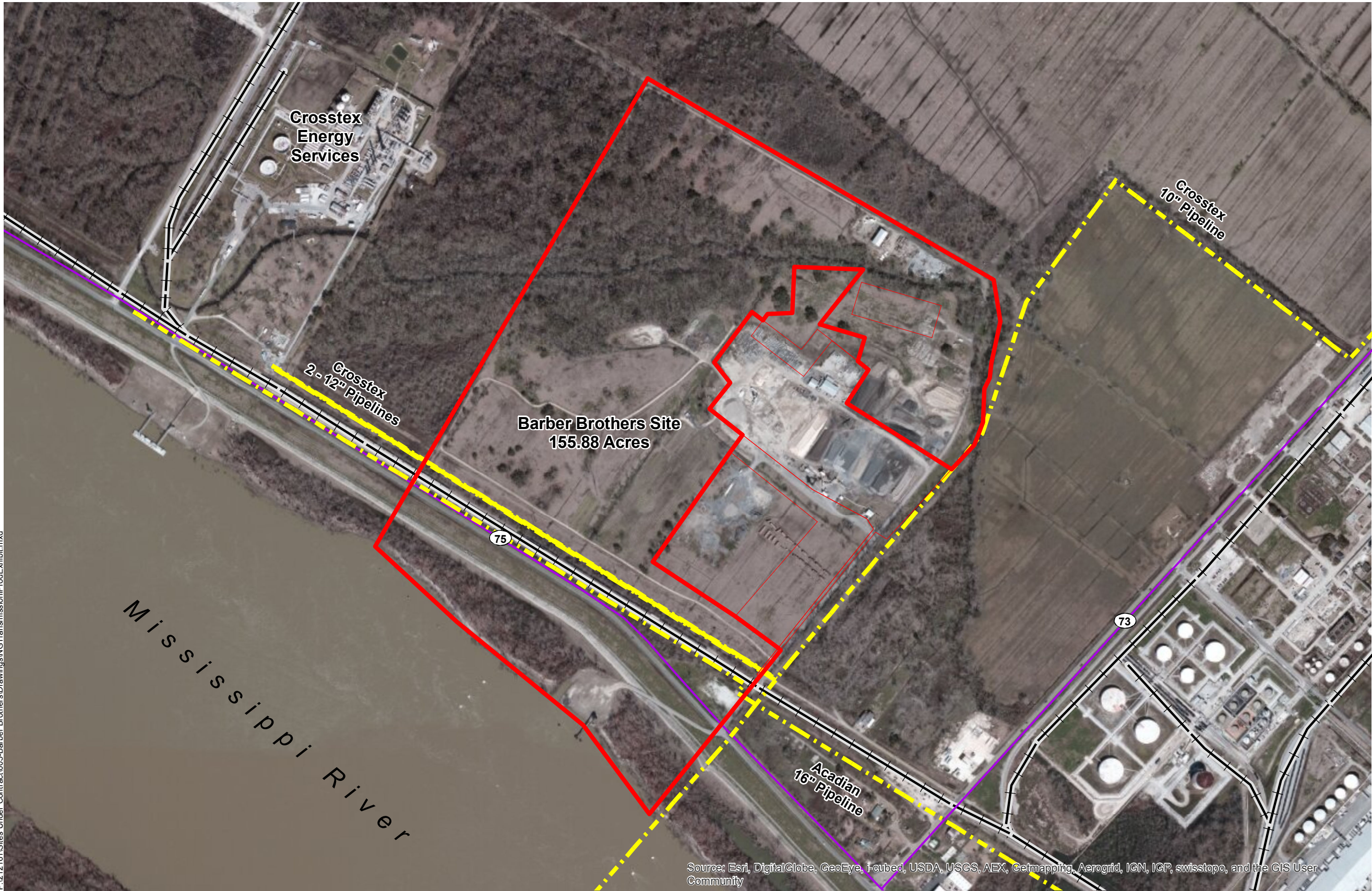
Exhibit R. Waterloo Site Natural Gas Transmission Infrastructure Map

P:\212161\Sites Under Contract\005-Barber Brothers\Drawings\NG Transmission\Prod\Exhibit.mxd