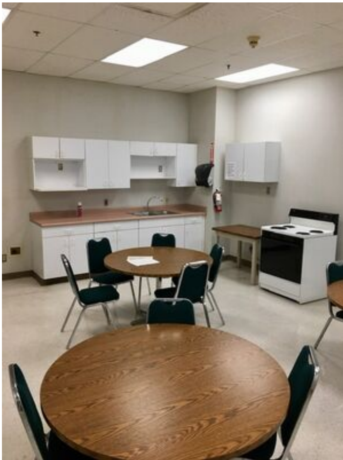
Suite 100 – Break Room