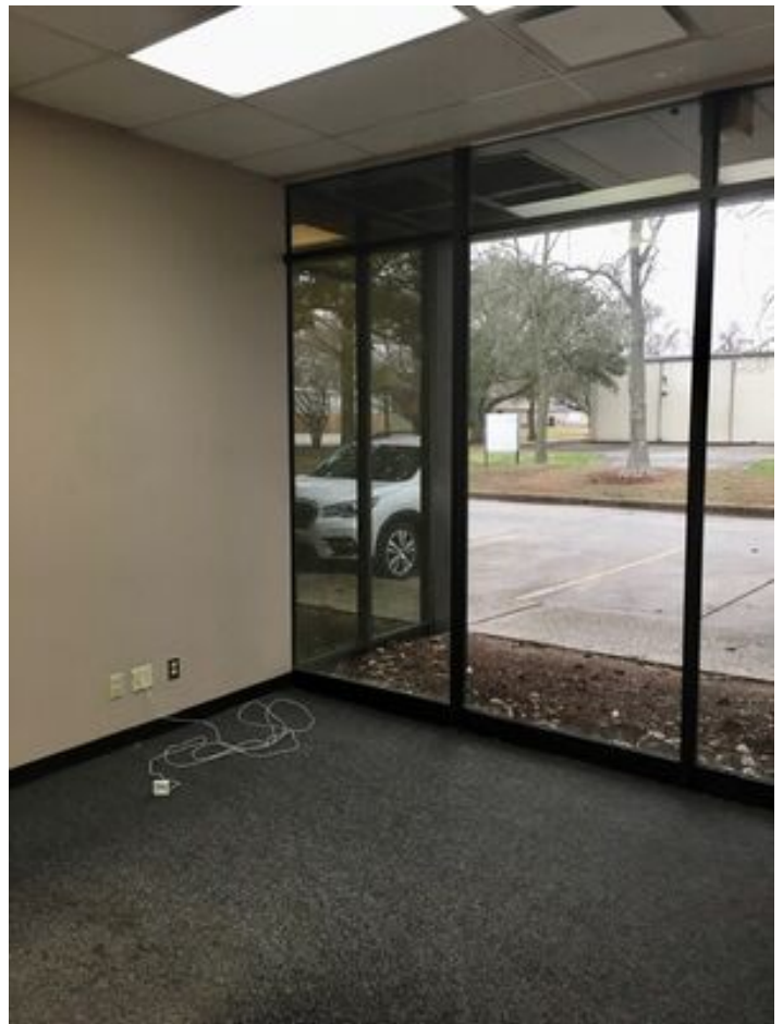
Suite 100 – Office (1)