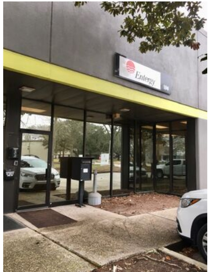
Suite 100 – Entry