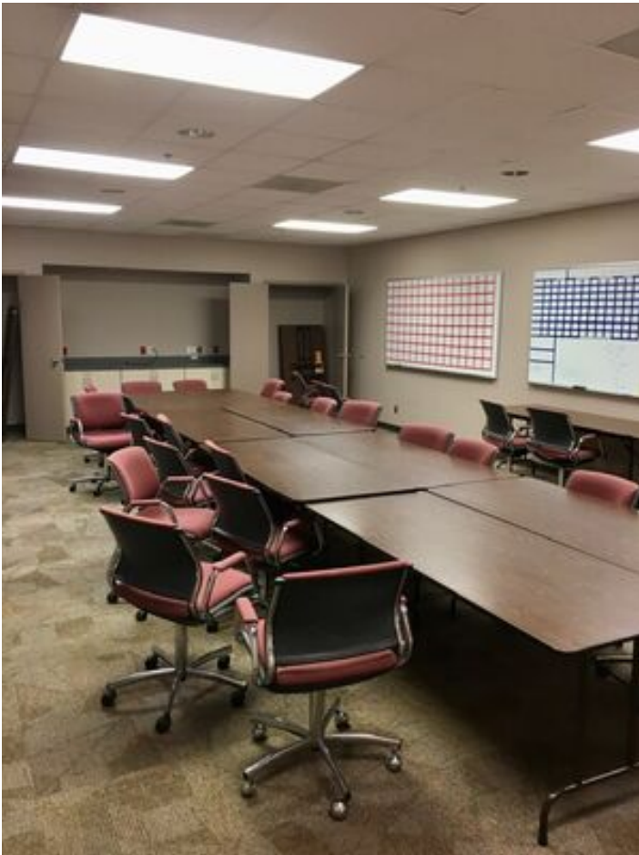
Suite 100 – Conference Room