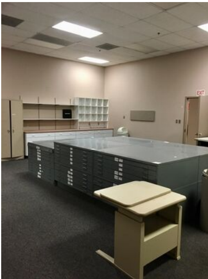
Suite 100 – Files and Repro (1)