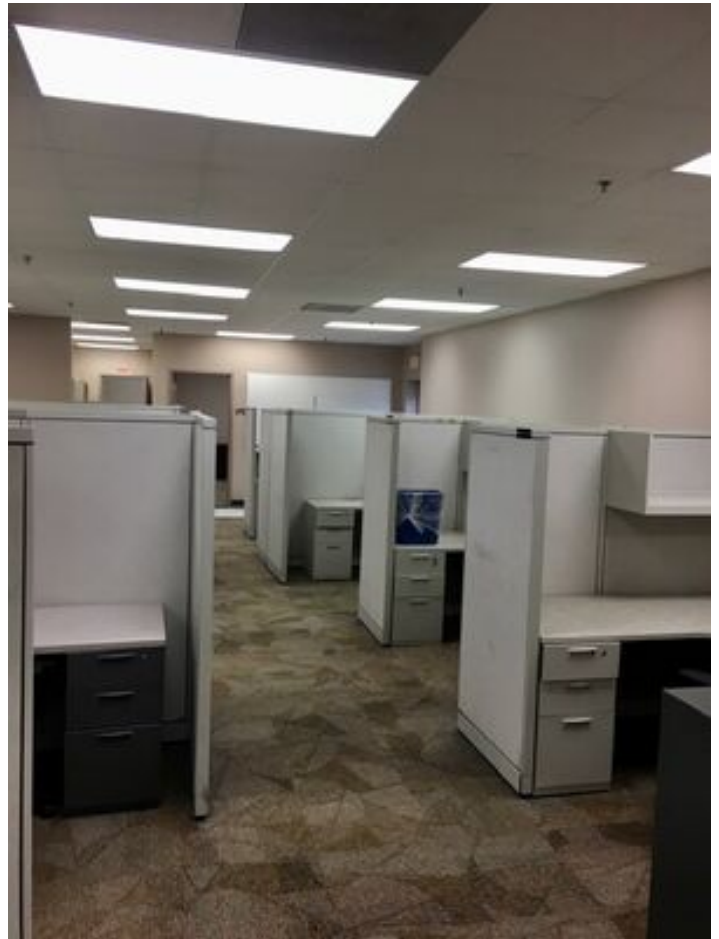
Suite 100 – Open Office (1)