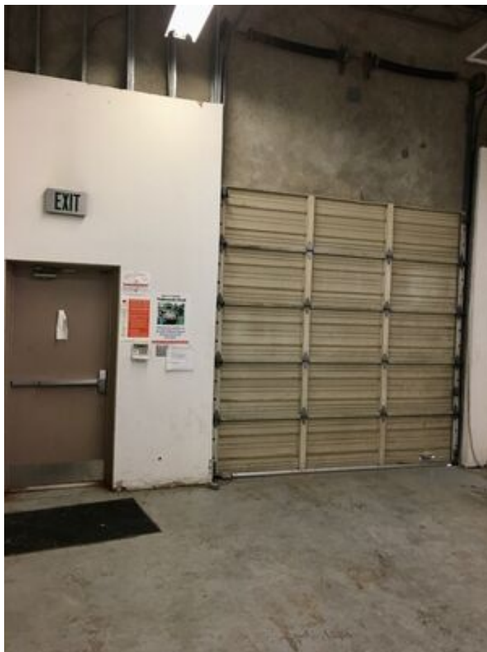
Suite 100 – Warehouse