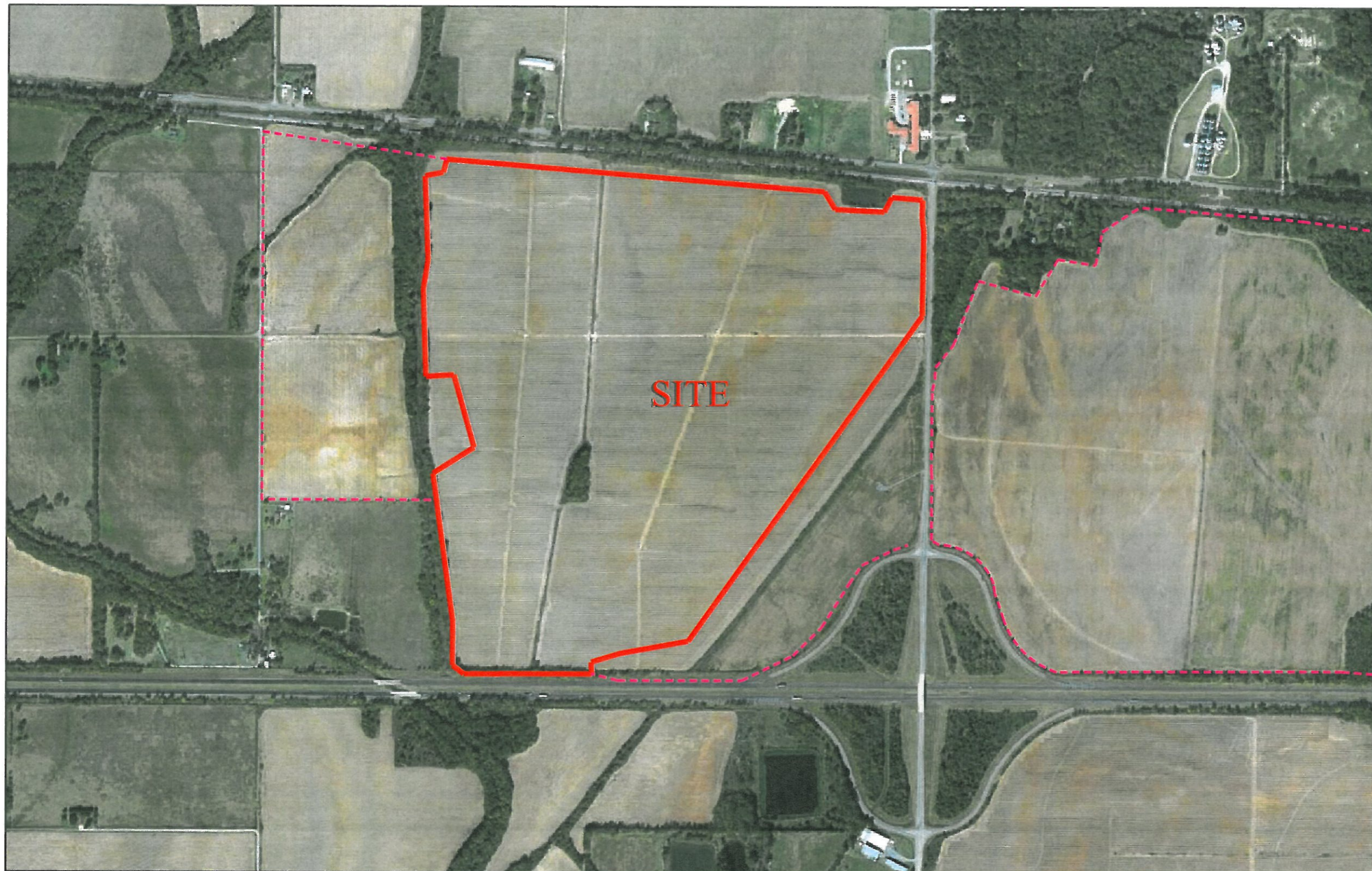
EXHIBIT R, HOLLY RIDGE NORTHWEST SITE AERIAL PHOTO, 2012