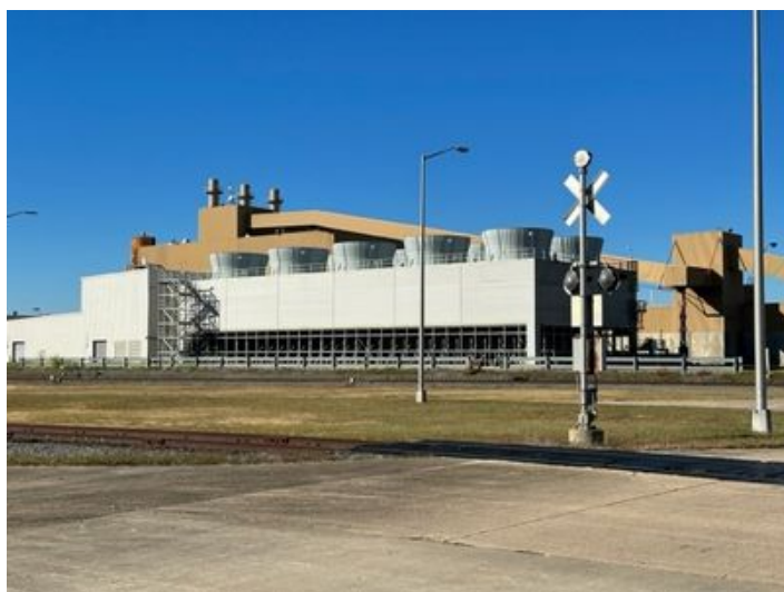
7600 ANTOINE COOLING and POWER HOUSE