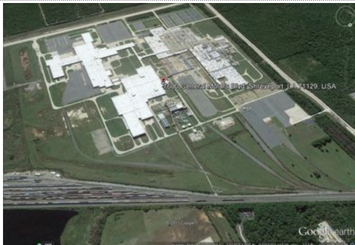
7600 ANTOINE BOULEVARD, SHREVEPORT, LA