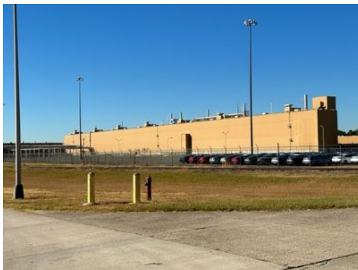
7600 ANTOINE BLDG C ELPO