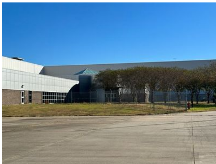
7600 ANTOINE BLDG A OFFICE ENTRANCE