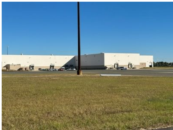
7600 ANTOINE BLDG A LOADING VIEW 1