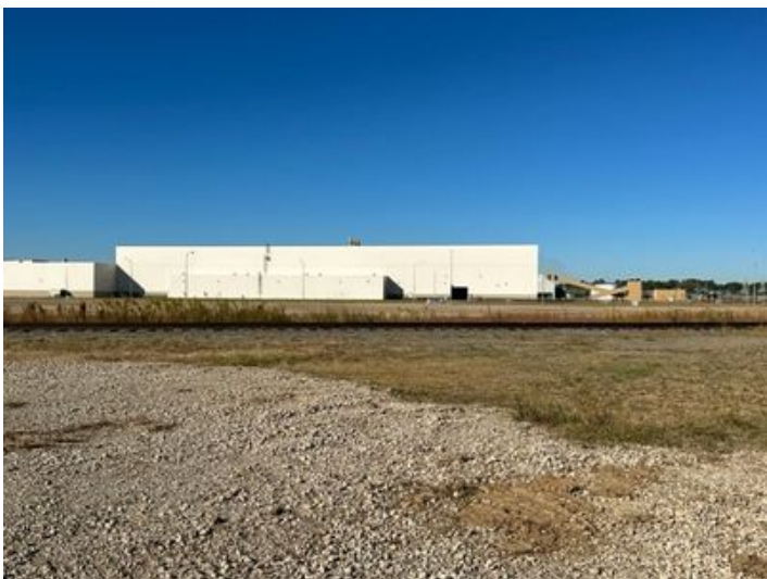
7600 ANTOINE BLDG B 2