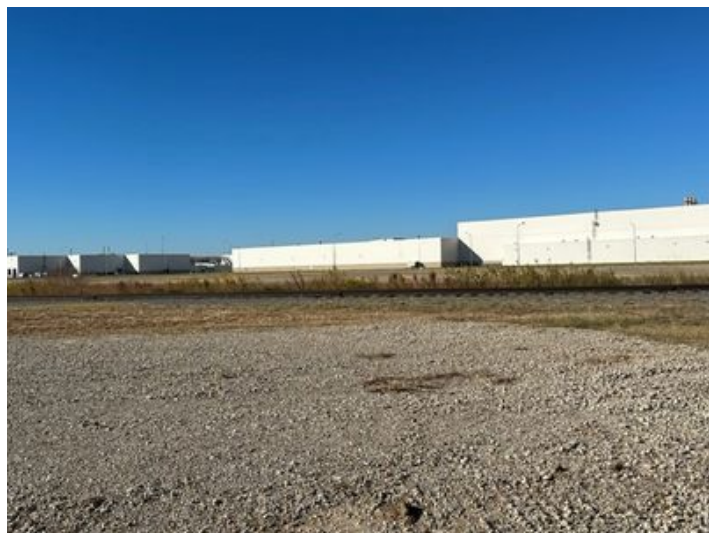
7600 ANTOINE A B