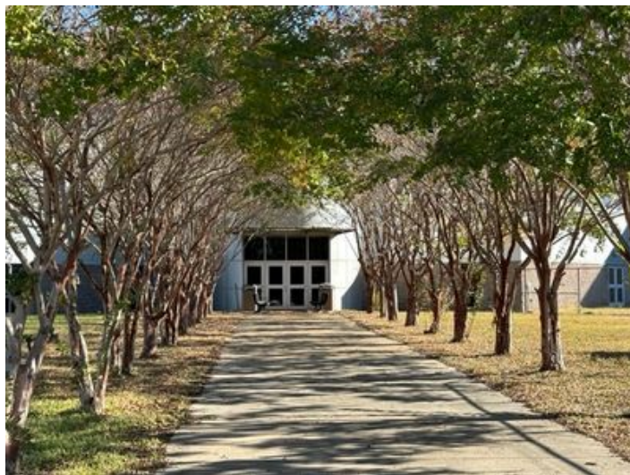
7600 ANTOINE BLDG A OFFICE ENTRANCE CREPE MYRTLES