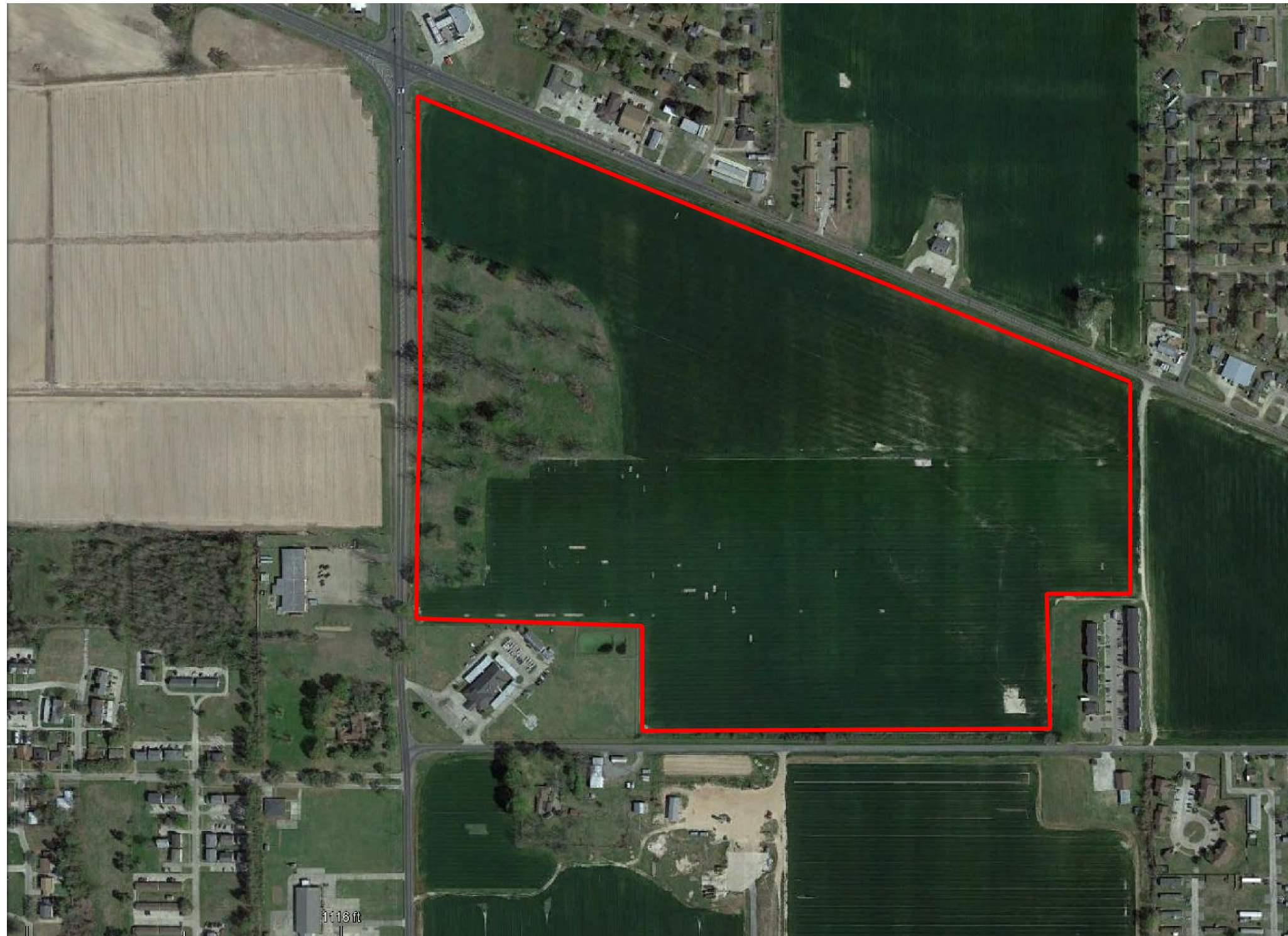
EXHIBIT Q, PETTY NORTH SITE AERIAL PHOTO, 2013