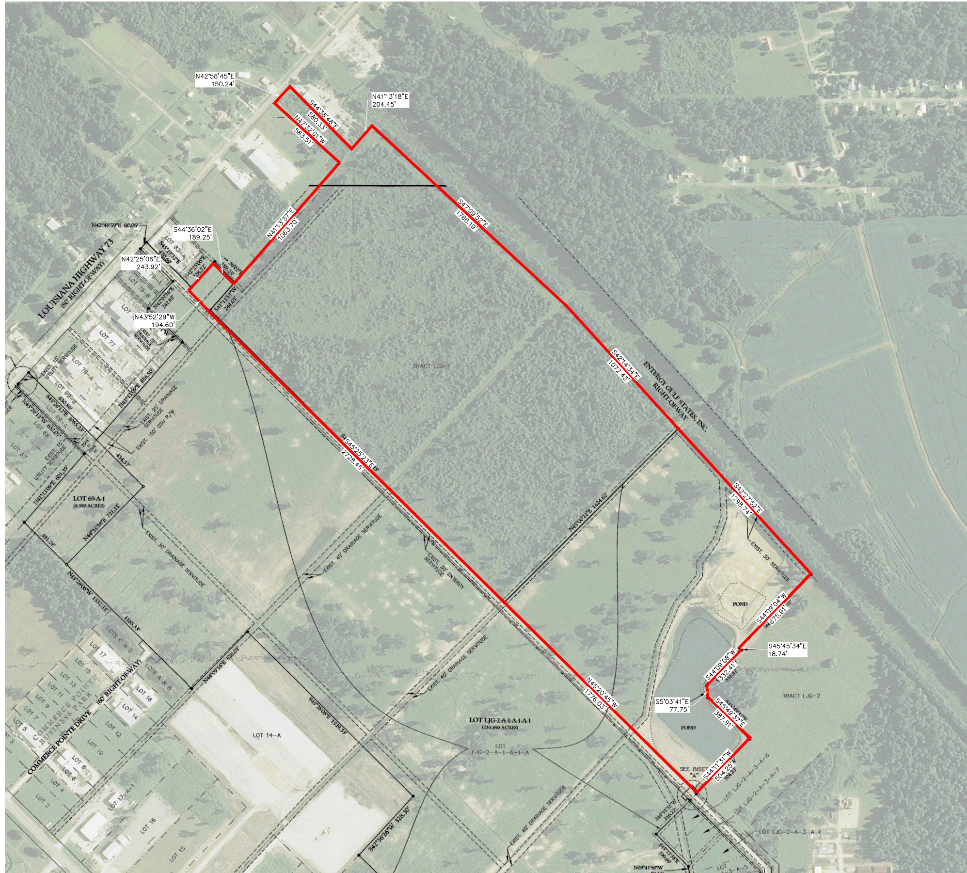
Exhibit F. Grezaffi North Site Property Boundary Aerial Survey