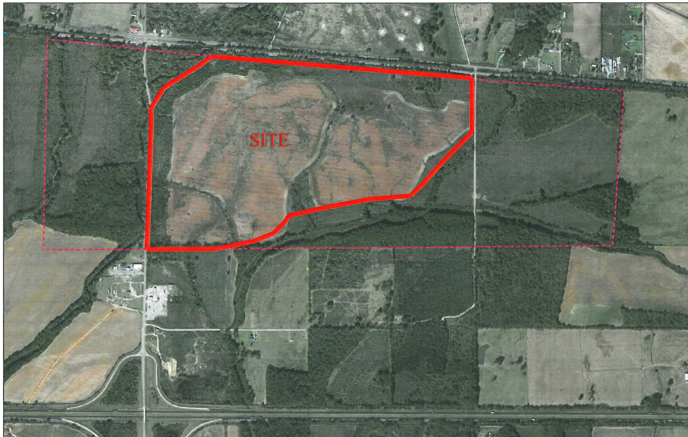
EXHIBIT R, AERIAL PHOTO OF BEE BAYOU SITE, 2012