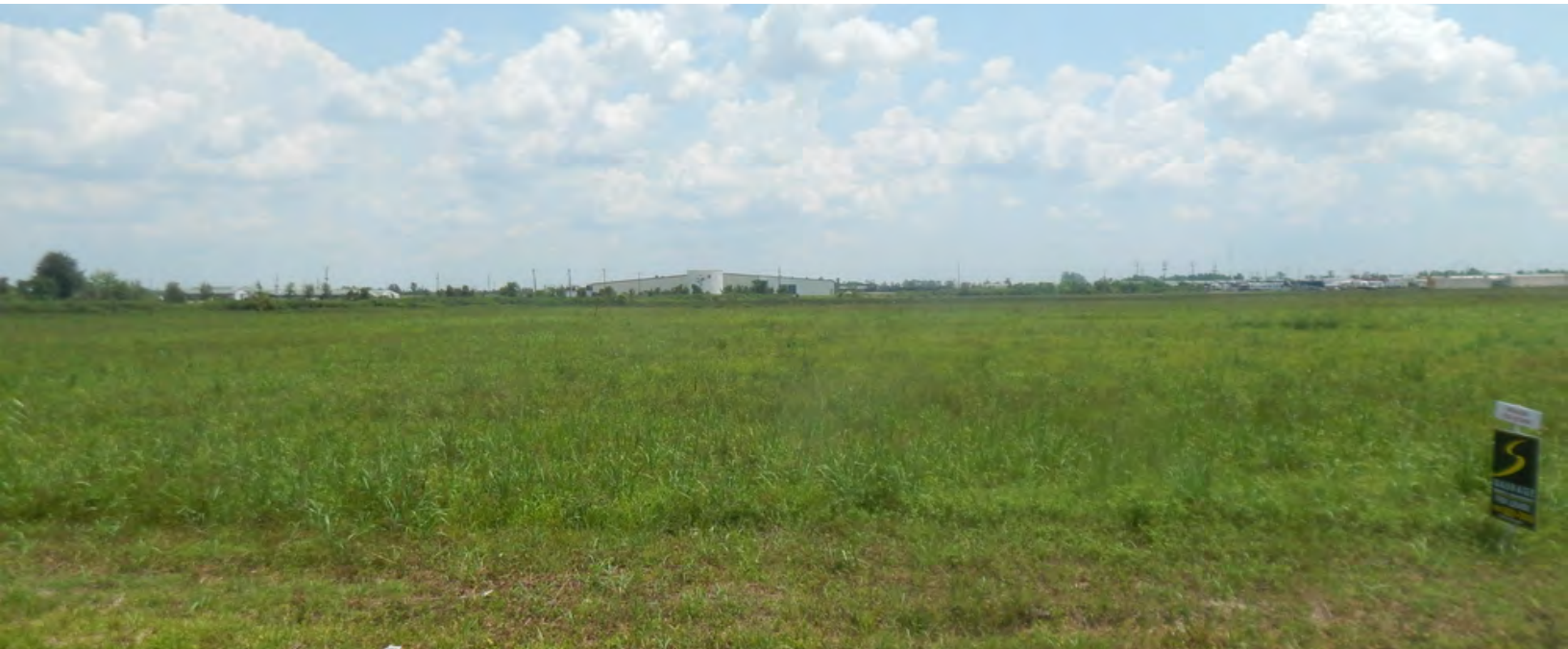
4 - 33 Acres Available