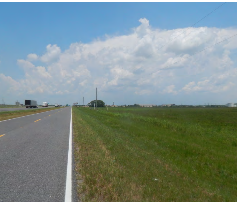
View from I-10