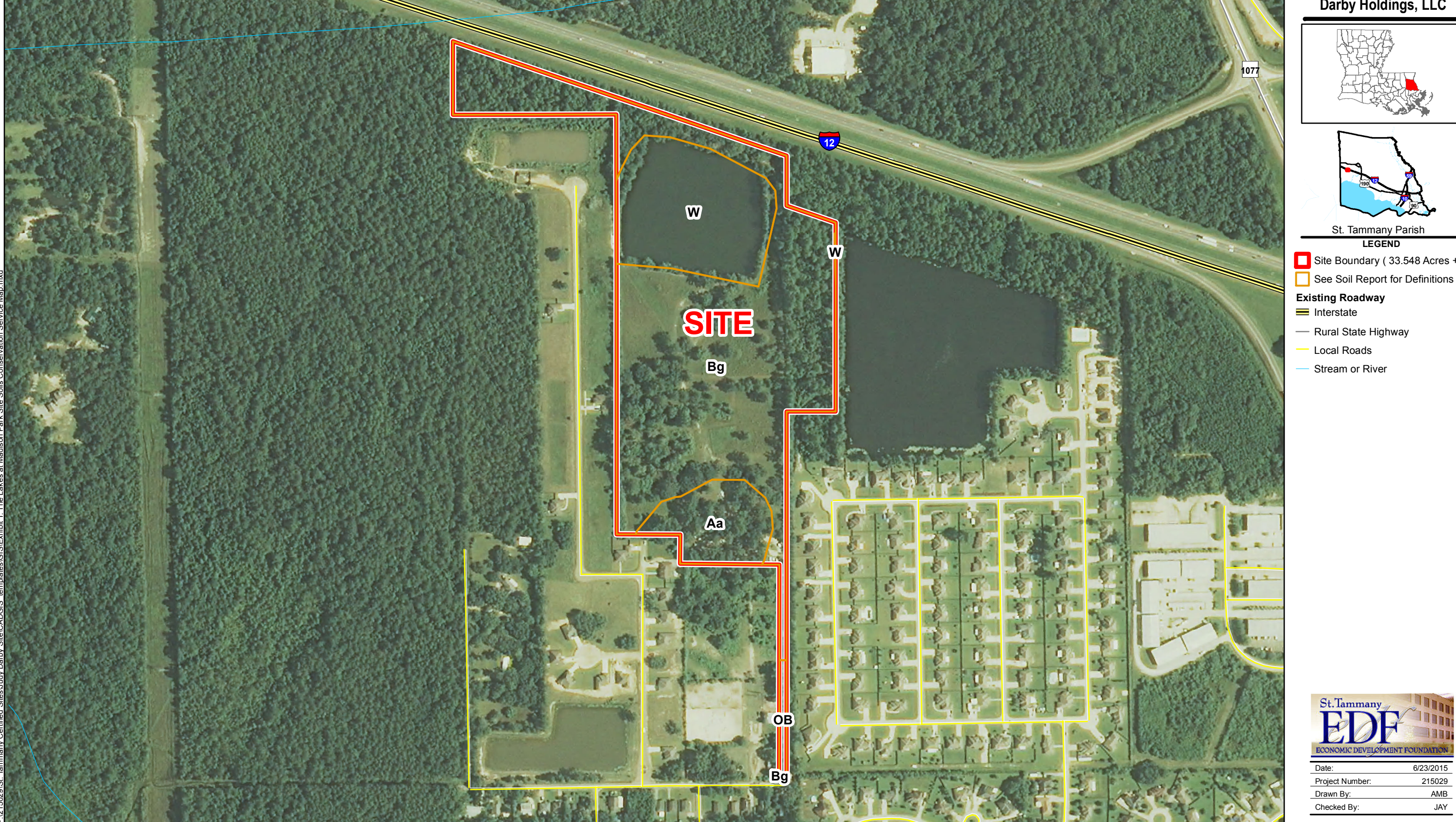
Exhibit T. The Lakes at Madison Park Site Soils Conservation Service Map