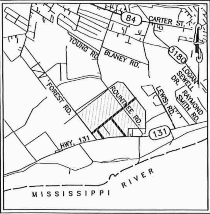
VICINITY MAP Scale: 1"=2000'±