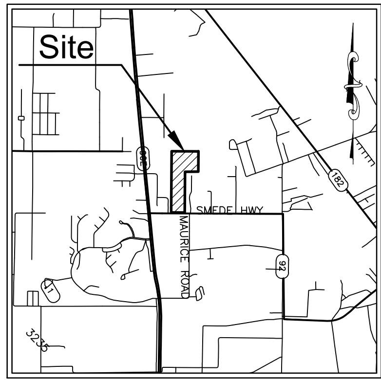
VICINITY MAP Scale: 1"=4000'±