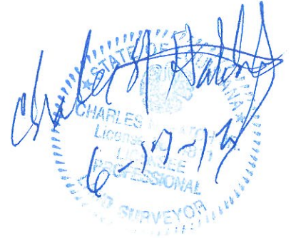
EXHIBIT D A LEGAL DESCRIPTION OF A 77.159 ACRE TRACT FOR GEORGE B. FRANKLIN & SON, INC (TRACT I) HOLLEY RIDGE NORTHWEST SITE SITUATED IN SECTIONS 10 & 15, T-17-N, R-8-E RICHLAND PARISH, LOUISIANA