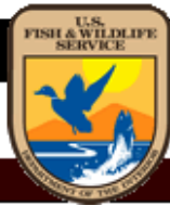
Exhibit #19 - Johnny F. Smith Business Park - National Wetlands Inventory Map