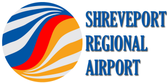
Exhibit DD. Shreveport Airport Warehouse District Site LA Dept. of Wildlife & Fisheries Letter