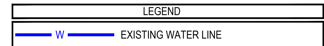
EXHIBIT 8a WATER SERVICE MAP