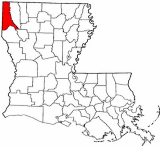
Figure 1. Map showing the location of Caddo Parish in the state of Louisiana.

Cultural Resource Analysts, Inc. (CRA), personnel completed a file search on December 17, 2010, and fieldwork between December 28, 2010, and January 11, 2011, for the proposed Louisiana Economic Development (LED) Certified Site in Caddo Parish, Louisiana (Figure 1.1). This file search and cultural resource survey was conducted at the request of Jacob Herrington of Franks Investment Company, L.L.C., to meet the requirements of the LED certification program. The proposed project area consisted of approximately 126.67 ha (313 acres) of mixed hardwood and pine forest. The archaeological file search using information provided by the Louisiana Office of Cultural Development Division of Archaeology (LA SHPO) was conducted by Justin Morrison. Fieldwork for the project was completed by Paul D. Bundy, Jason D. Weston, Justin B. Morrison, and J. Joshua Hill in approximately 200 person hours. The cultural resource survey was supervised by Jason D. Weston. A copy of the Scope of Work is provided as Appendix A.