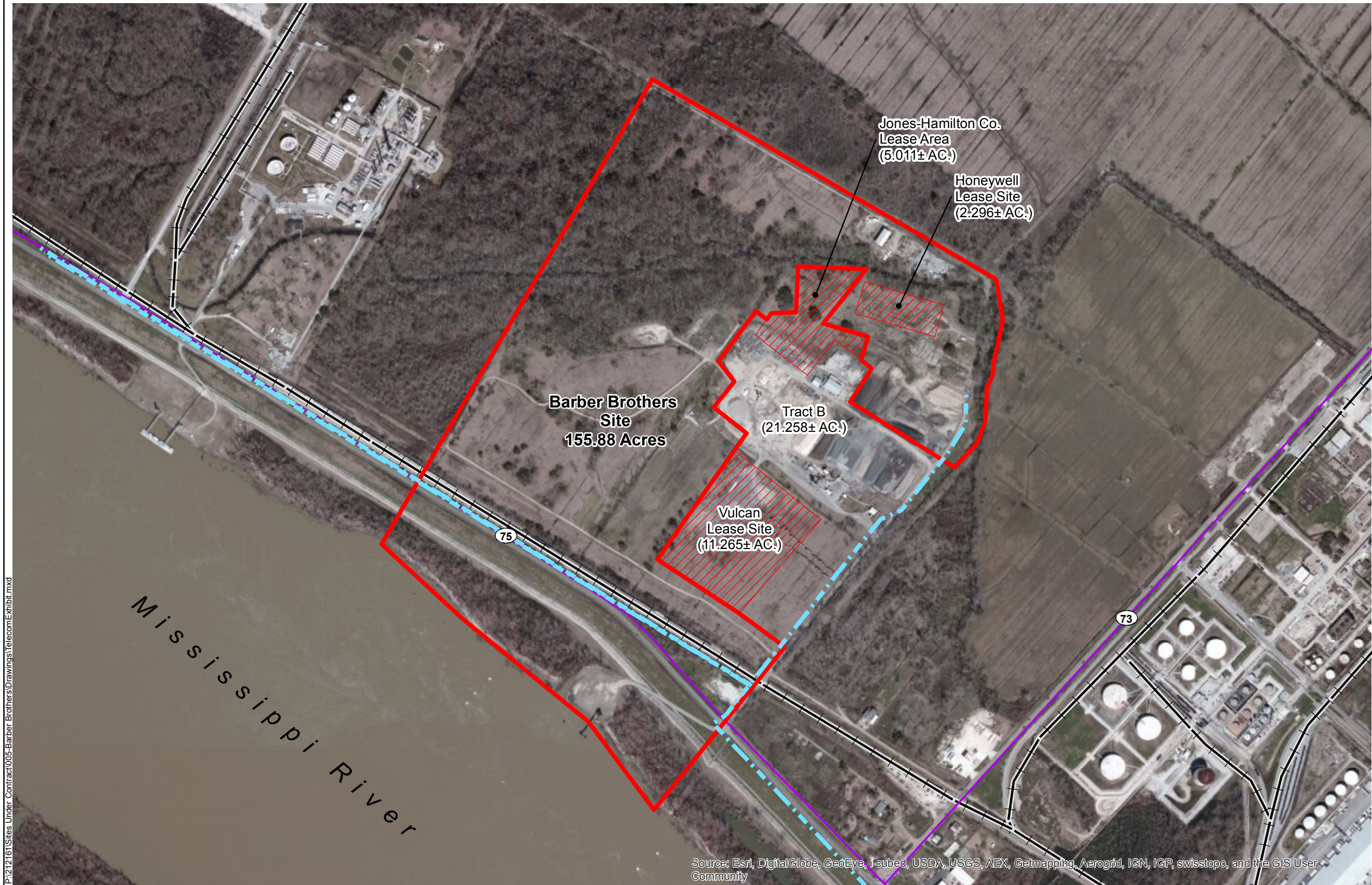
Exhibit T. Waterloo Site Telecommunications Infrastructure Map

P:\212161\Sites Under Contract\005-Barber Brothers\Drawings\Telecom\Exhibit.mxd