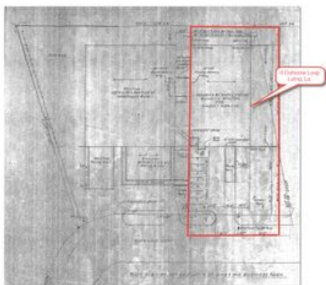
6B Dufresne Loop-Luling-LA- 2nd Site & Building Sketch