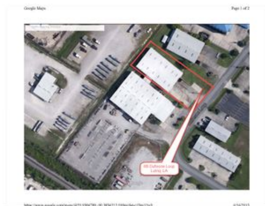
6B Dufresne Loop-Luling-LA-Aerial view