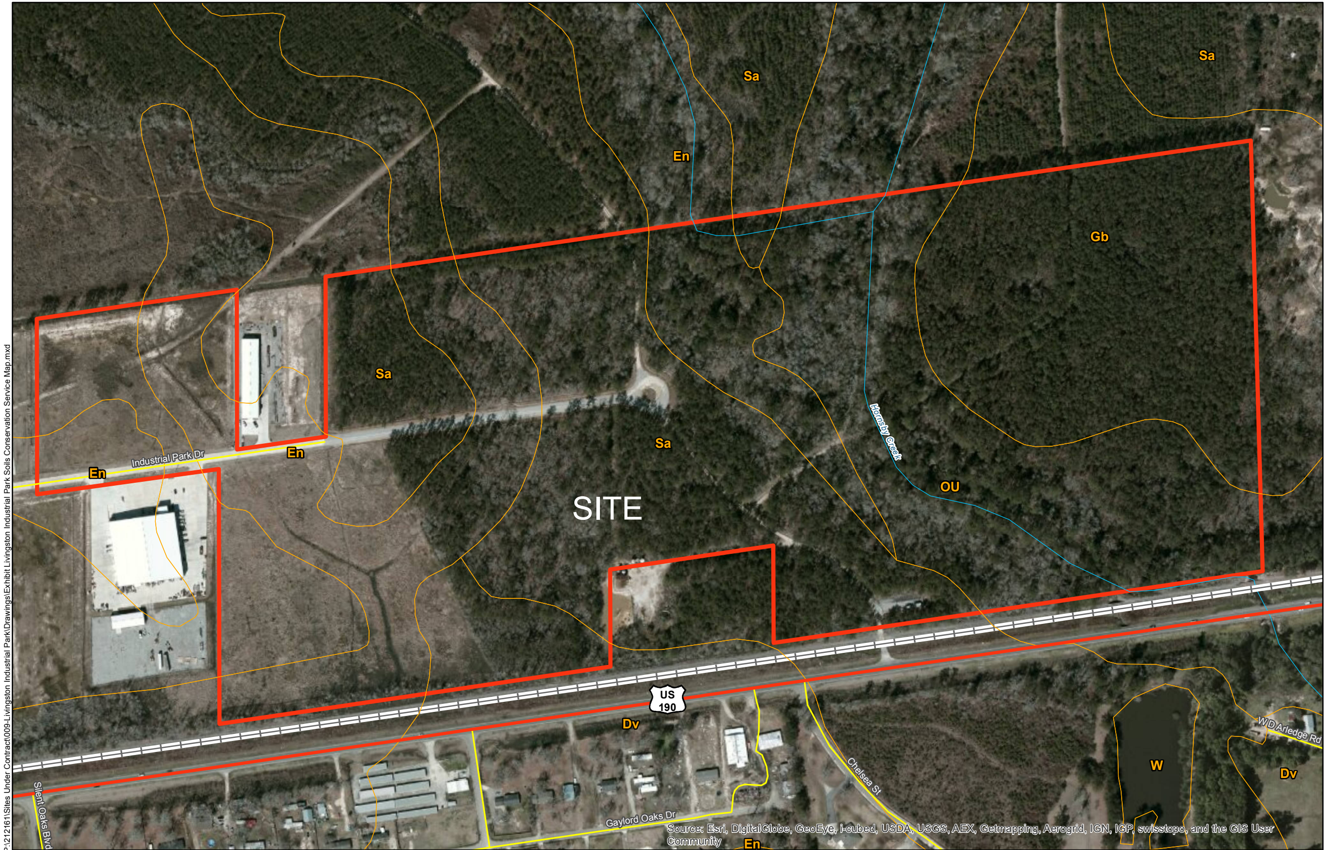
Exhibit X. Livingston Industrial Park Soils Conservation Service Map

Project: Site Exhibit for Livingston Industrial Park Livingston Parish, LA